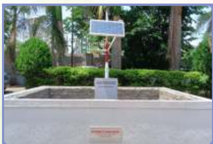
Automatic Rain Gauge system

The college is 14001-2015 certified and also recognised as green educational campus. In addition to this, the college is also awarded zero waste certificate from PCMC due to its onsite composting pit, rain water harvesting, solar panel system and E-waste Management activities. Indian Meteorological department's Automatic Rain Guage machine (ARG) has been installed by the Indian Meteorological Department in Dudulgaon Educational Complex. Information about temperature, humidity and rainfall in the area can be seen on the website of the weather department. Automatic Rain Guage machine has been installed at Rajmata Jijau Educational Complex under the guidance of Hon. Dr. Hosalikar, Scientist IMD Pune department run by the Ministry of Earth Science. This machine was inaugurated by Principal of College of Pharmacy. This realtime weather information will be useful for all factors such as district government institutions, disaster management, students, weather forecasting, as well as agriculture sector. Besides this the college has also developed solid and liquid waste management pits and rain water harvesting system Special efforts for these activities were done by Prof. Mr. Amol Kumbhar, Prof S. Shaikh under the able guidance of Dr. K.S. Jain Sir.