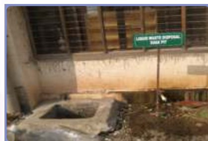
Liquid Waste Management Pit