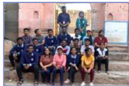
Visit to Historical place in village