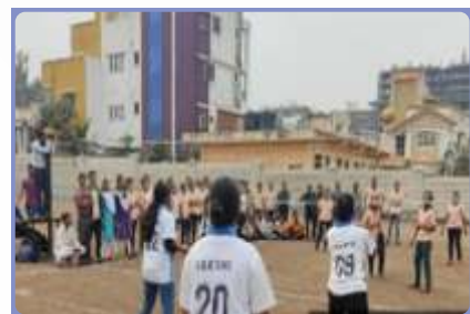
Students in action during sports week