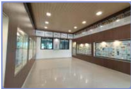
RJSPM COP Museum