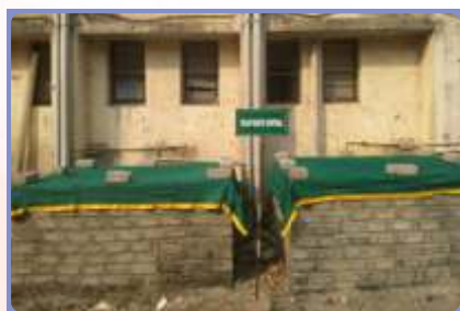
Solid Waste Management Pits