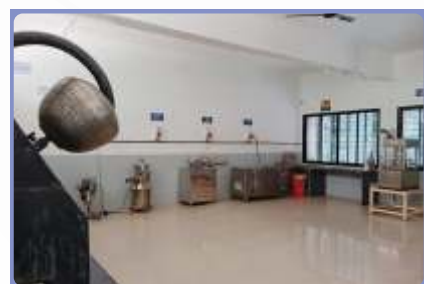
Well-equipped Machine Room