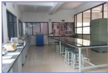
Modular Instrument Room