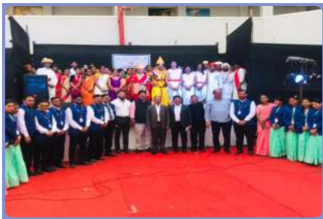
Entertainment Program of NAAC