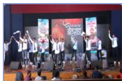
Dance performance by 3rd year students on occasion of "Spandan 2K23"