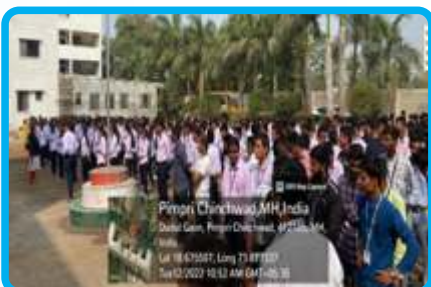
Student's present on "Mahaparinirvan Diwas"