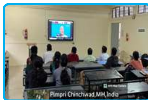
Glimpses during the webinar