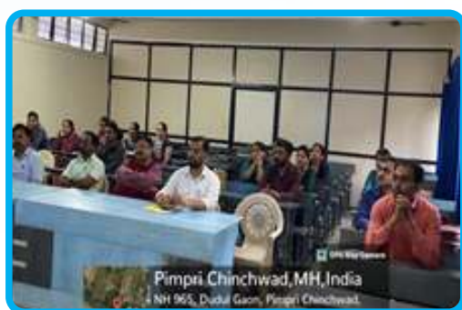
Faculty attending the KMM webinar