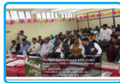
All Guests and students in event