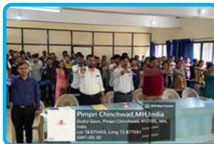
Audience while reading the Preamble of the Constitution