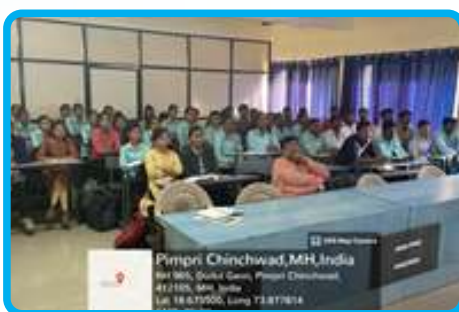
Students while listening the webinar