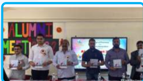
Publication of Alumni Calendar

The inaugural session was attended by staff members and students of RJSPM College of pharmacy. In this session the publication of the Alumni calendar took place and the calendar was distributed to all alumni with a registration kit.