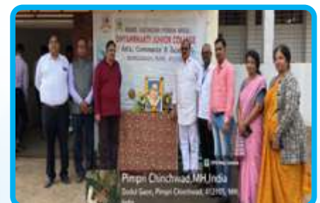
"Mahaparinirvan Diwas" celebration by staff