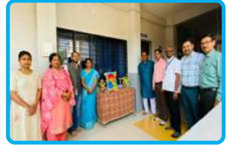
Jayanti celebration by staff