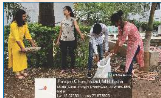
Plastic Collection from various area of Dhayarkar Wasti