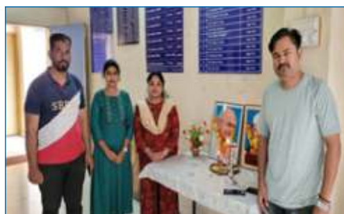
Jayanti celebration by staff