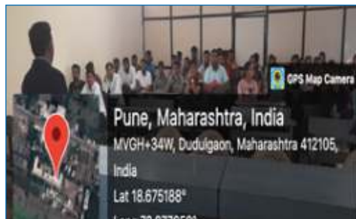
Lecture on Topic, "Career After Pharmacy"