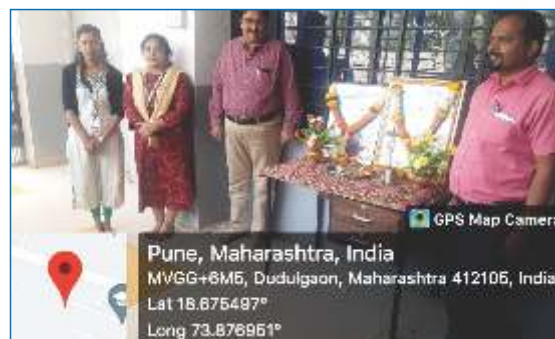
Sardar Vallabhbhai Patel Jayanti .....Run for Unity