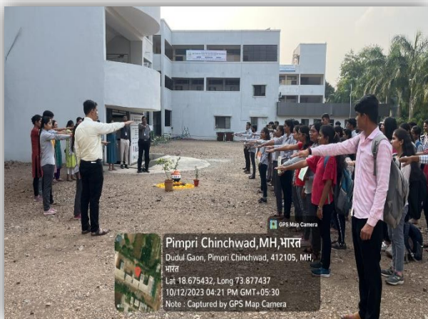
Student taking pledge