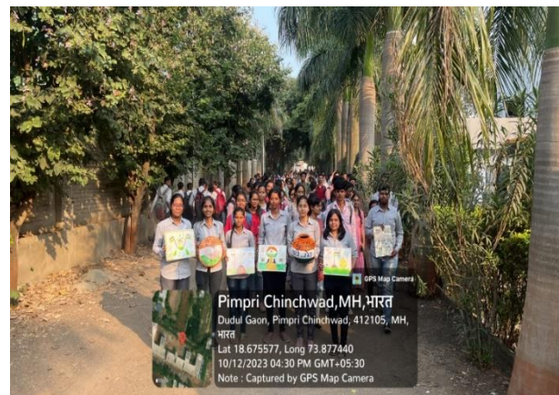
Student taking the rally