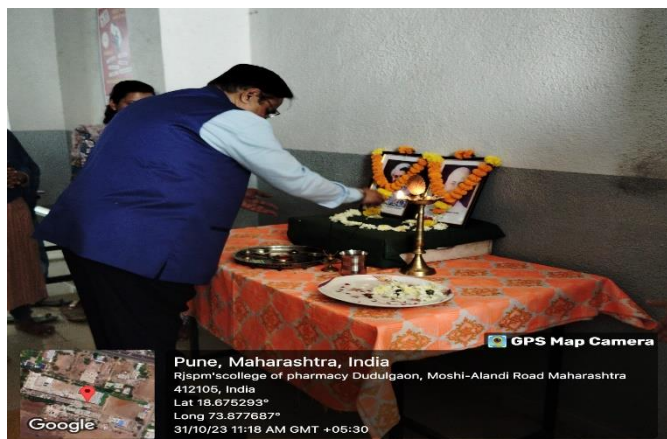
Floral tribute to both the heroes