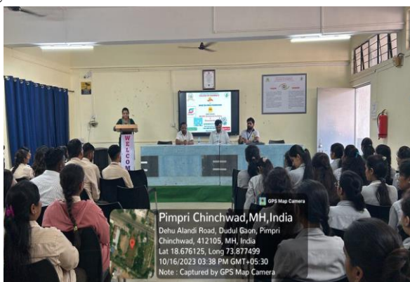
Welcome of guests