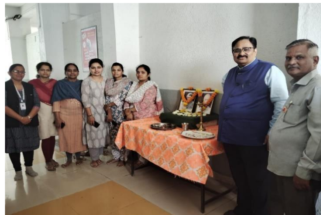
Staff paying their homage to the national heroes