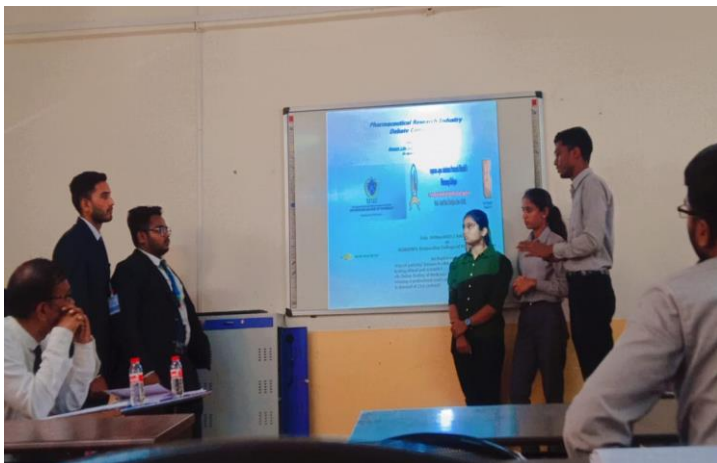
Students participating in Debate competition

RJSPM College takes pride in announcing the outstanding achievement of its students in the recent Debate Competition organized by Beaver Life sciences. The competition, witnessed enthusiastic participation from various pharmacy colleges, and our students demonstrated exemplary debating skills, securing the 2nd prize in the event. The Debate Competition, organized by Beaver Lifesciences, aimed to foster intellectual discussions and critical thinking among pharmacy students. The participants were tasked with addressing contemporary issues, challenges, and advancements in the pharmaceutical and healthcare industries. The event provided a platform for students to showcase their research, public speaking, and argumentative skills. We extend our heartfelt congratulations to the winning team for their remarkable achievement and look forward to more such accomplishments in the future.