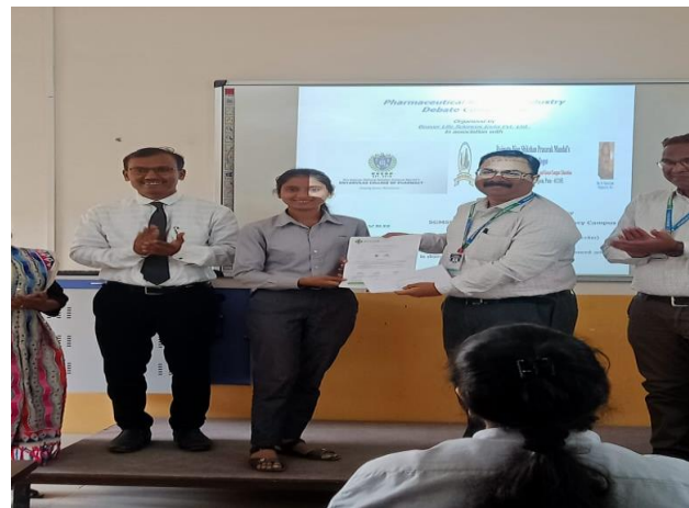
Students receiving prize