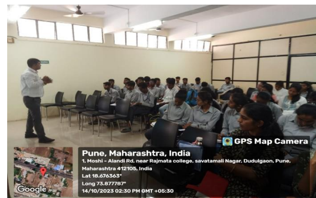
Speaker guiding the students