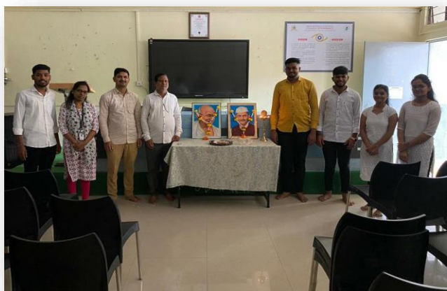
Gandhi Jayanti celebration by staff