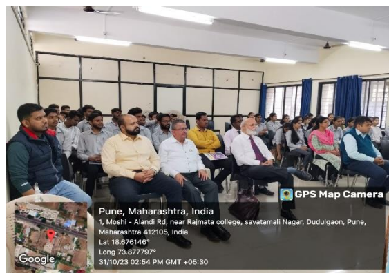
Audience listening to session