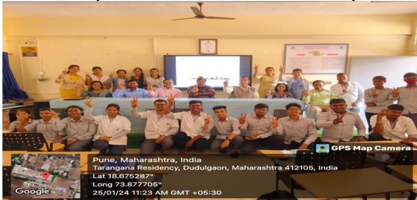
Student's Enthusiasm After Voter's Day