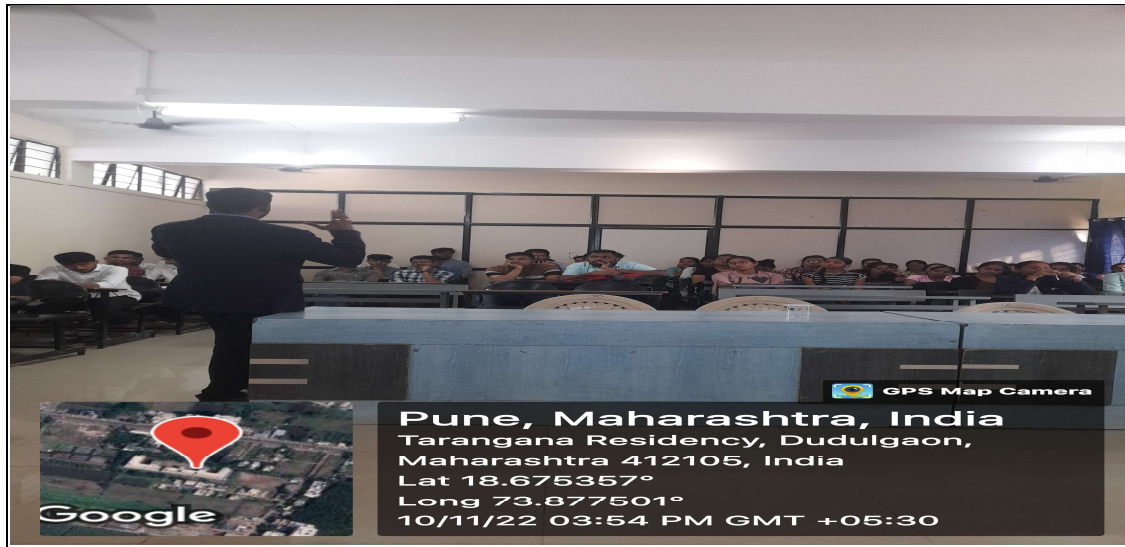
Students While Listening the Seminar Actively