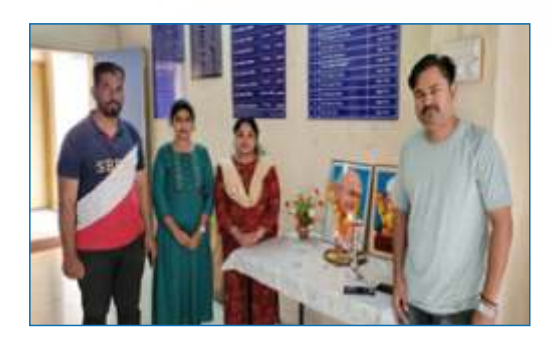
Jayanti celebration by staff